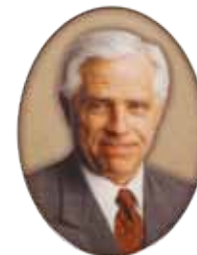
Full color No relief No Border