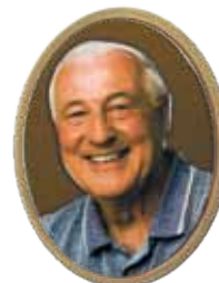
Full color 3-D relief Border