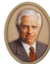
Full color No Relief Border