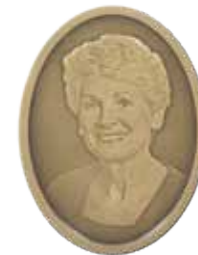
Oxide Finish 3-D Relief Border